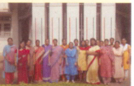
BVM Ladies' with Big Smiles !