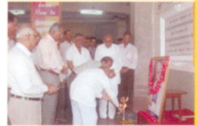
BVM family members sharing moments of joys of stepping into 60th Birthday