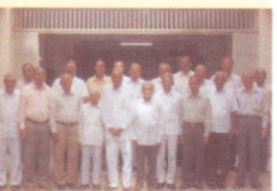
Executive Team on Diamond Jubilee Inaugural Function (14-06-2007)