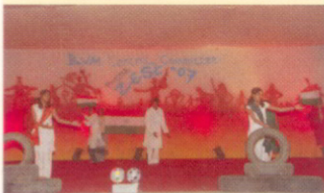
Glimpses of Annual Day Cultural Programme