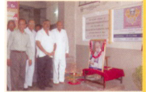
Diamond Jubilee Inaugural function@9.30 a.m. on 14-06-2007